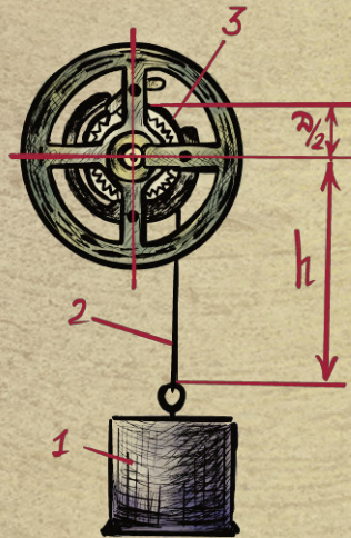
Figure 3: Diagram of the weight-driven engine. 1 – weight, 2 – chain, 3 – sprocket.